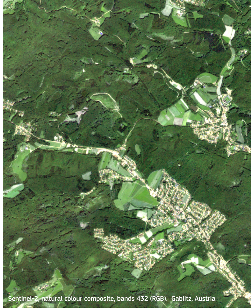
Sentinel-2, natural colour composite, bands 432 (RGB). Gablitz, Austria

The Copernicus Land Monitoring Service is free to access by any citizen or organisation in the world.