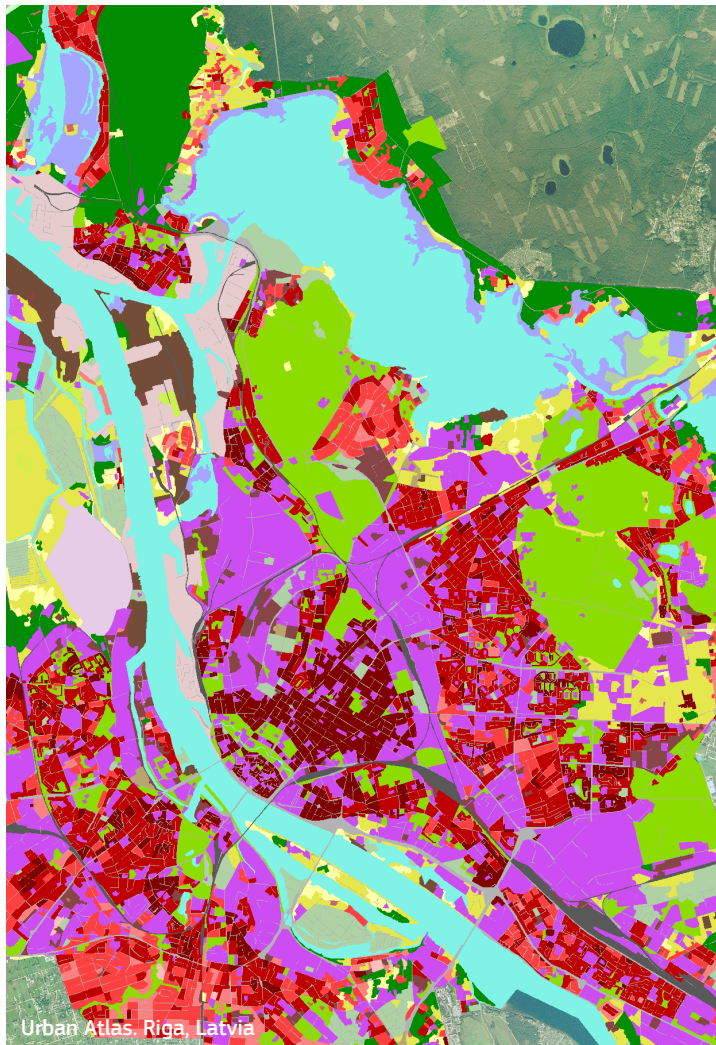
Urban Atlas. Riga, Latvia